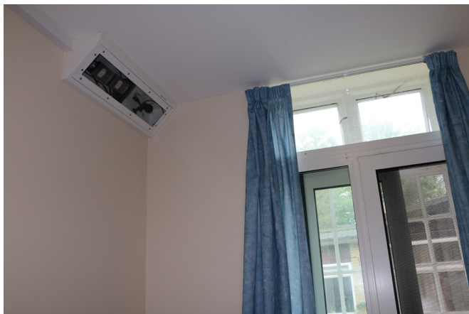
Figure 1 Digital sensor in bedroom.

The key innovation in this project is the use of Oxhealth sensors, which employ a software that uses computer vision, signal processing and AI techniques to track micromovements and colour changes (through photoplethysmography) on the body from several metres away. From these small signals, the pulse rate and breathing rate can be calculated. These techniques are akin to an automated version of the counting of chest movements commonly used in hospitals and a non-contact version of the widely used finger pulse oximeter. There is therefore no disturbance to the patient, and a breathing rate can still be calculated when the patient is fully covered by bedding. Previous studies have evaluated the technology in specific populations: renal patients undergoing dialysis, 22 neonates in intensive care, 23 adults in intensive care, 24 and patients and staff in a high-security mental health setting. 25 The British Standards Institute, acting as a notified body on behalf of the Medicines & Healthcare products Regulatory Agency, has accredited the sensors' vital signs measurement software as a class IIa medical device in Europe (figure 1). The sensors use an infrared camera, attached to a discreet wall-mounted monitor so they can function at night without having to switch lights on.